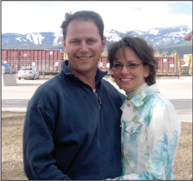
Working for tax relief Working for small business Working for Montana families Working for You